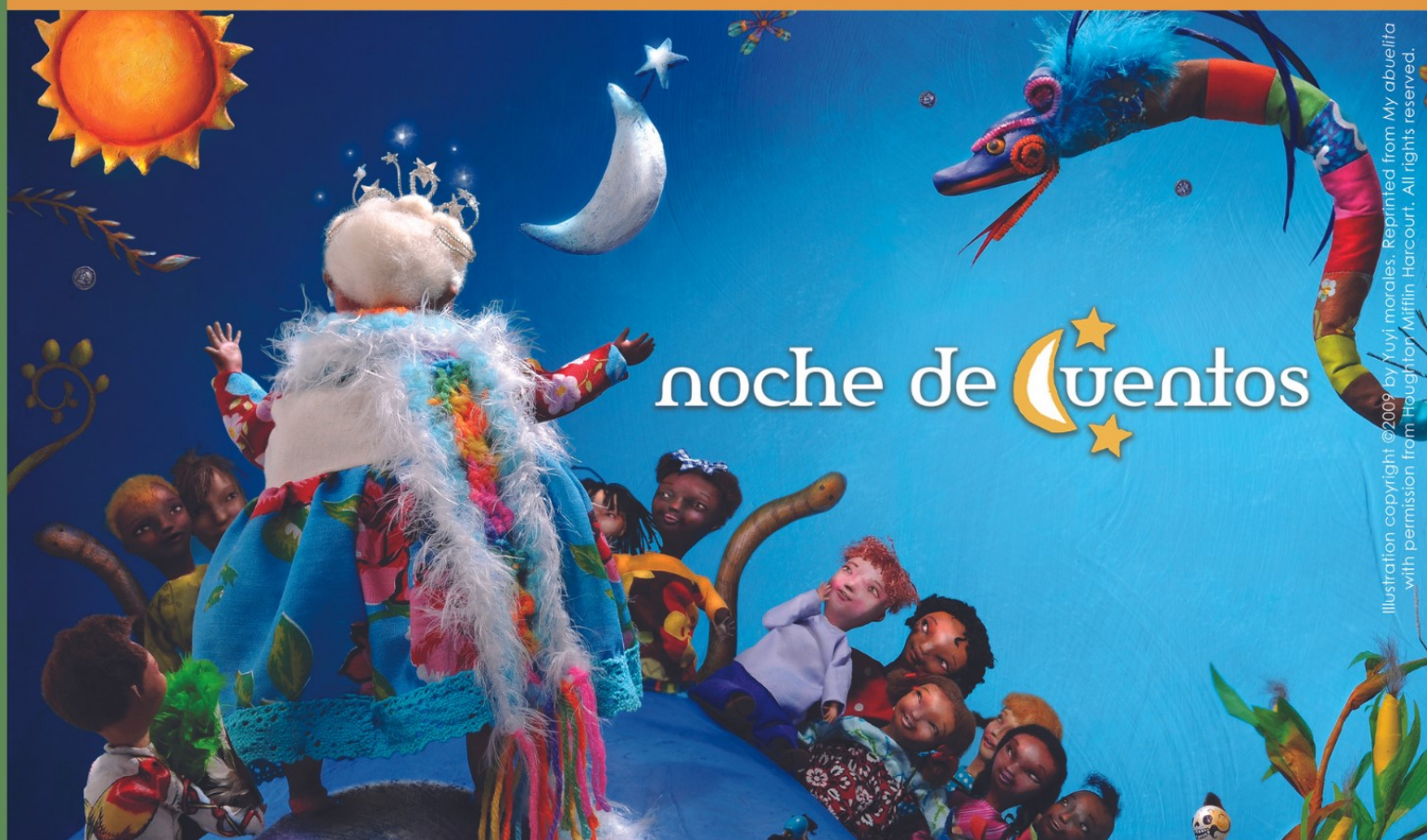
Illustration copyright ©2009 by Yuyi Morales. Reprinted from My abuelita with permission from Houghton Mifflin Harcourt. All rights reserved.